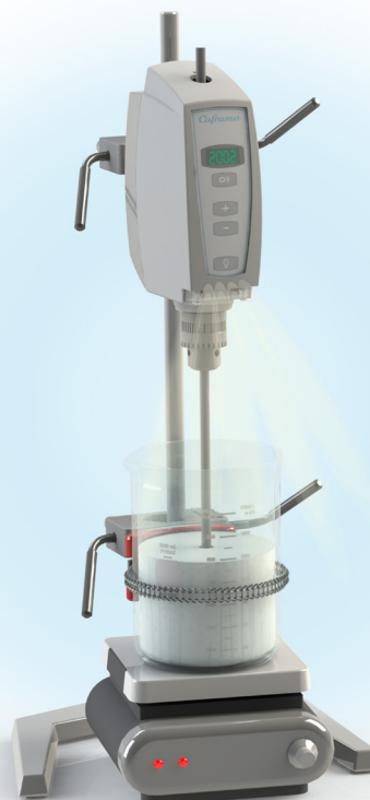
Polymer solution formulation