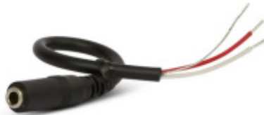
Probe Adaptor Pigtail for CSI Data Loggers